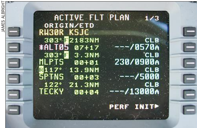
TECKY ONE departure on a Gulfstream 450 FMS.

In 1998, a tower controller's error at LaGuardia Airport brought a landing airliner within 20 ft. of another taking off. Neither the controller nor his supervisor reported the incident and only the airline pilot's complaints to the NTSB brought the incident to light. Subsequent investigations uncovered a pattern of these failures to report and prompted the FAA to institute corrective programs called everything from "Air Traffic Quality Assurance" to the "Operational Error Detection Program." Real-time software systems, such as the Traffic Analysis Review Program (TARP), automatically detect, flag and report loss of separation and other occurrences at air traffic terminal facilities without controller input or knowledge. A controller may no longer have the ability to forgive an infraction and may in some cases be at risk when deciding to do so.