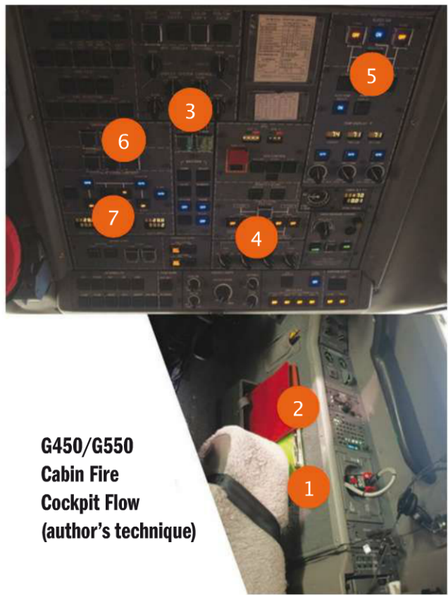
G450/G550 Cabin Fire Cockpit Flow (author's technique)

Most aircraft manufacturers provide detailed checklists that are exhaustive in scope but too time-consuming to complete. Post-accident simulator tests following the Swissair 111 crash revealed most crews required 20 to 30 min. to complete the MD-11 Smoke/Fumes of