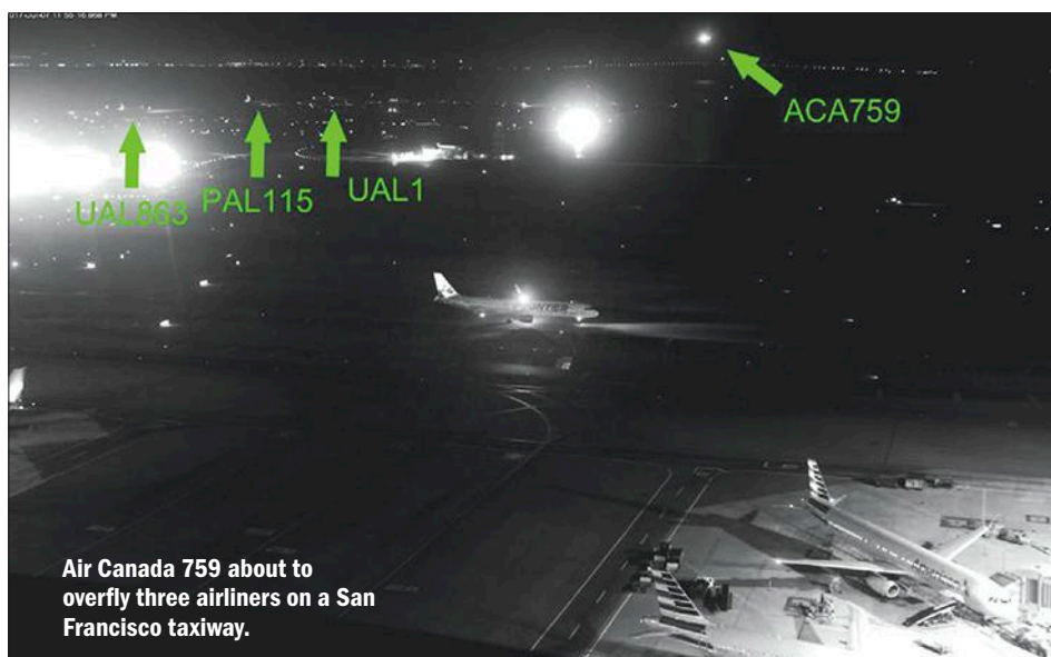
Air Canada 759 about to overfly three airliners on a San Francisco taxiway.

When the Golden BB finds its mark, lives can be lost, aircraft destroyed and reputations tarnished. Then come the recriminations, investigations and corrective actions. If