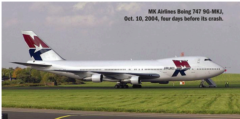
MK Airlines Boeing 747 9G-MKJ, Oct. 10, 2004, four days before its crash.

There have been a few transport category aircraft lost over the years because of improperly computed takeoff data; perhaps the worst example was MK Airlines Flight 1602. On Oct. 14, 2004, this Boeing 747 cargo flight took off from Windsor Locks-Bradley International Airport (KBDL) near Hartford, Connecticut, loaded with lawn tractors. The total gross weight was 240,000 kg (529,109 lb.).