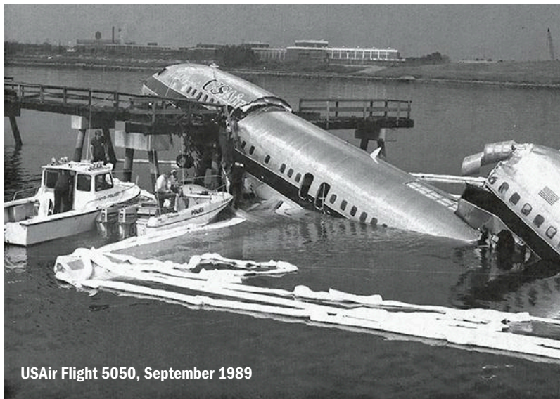
USAir Flight 5050, September 1989

one case of another transport category aircraft unable to maintain directional control because the rudder trim wasn't correctly set.