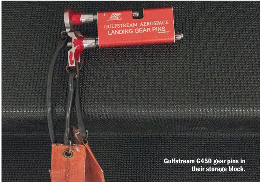
Gulfstream G450 gear pins in their storage block.

On April 11, 2017, the crew of Gulfstream G450 N667HS returned to land at Salzburg Airport, Austria (LOWS) after declaring a PAN. It appears the crew took off with the landing gear downlock pins installed, raised the gear handle to the UP position, and then returned the handle to the DOWN position, landed, and pulled the pins. On just about any other airplane, the story would have ended there. But because they failed to accomplish the checklist needed to reset the selector valve, things became complicated. After the pins were removed and hydraulic pressure reapplied when the pilots attempted to close the open gear doors, the landing gear retract circuits were