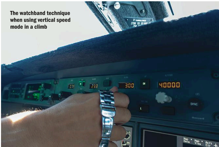
The watchband technique when using vertical speed mode in a climb

a straight wing with a conventional tail, you cannot be sure it will stall the way you have been taught. But even if you have practiced stalls in your aircraft, you cannot be sure it will stall the same way if loaded differently or in different conditions. You need to be paranoid of an aerodynamic stall, and that means you have to be paranoid about the vertical mode of your autopilot.