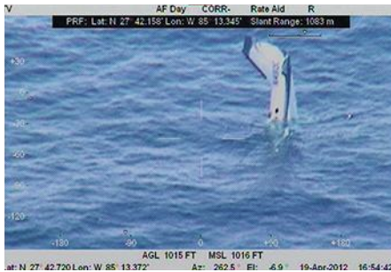
Cessna 421C N48DL, moments before submerging in the Gulf of Mexico.

If you are in the business of high-altitude flight, you probably regularly practice a decompression in a simulator with the aim of descending rapidly to breathable atmosphere. In fact, your initial aircraft type certification probably requires the maneuver. I have been practicing the maneuver in all sorts of aircraft simulators and have had it happen to me in real airplanes twice. There was no