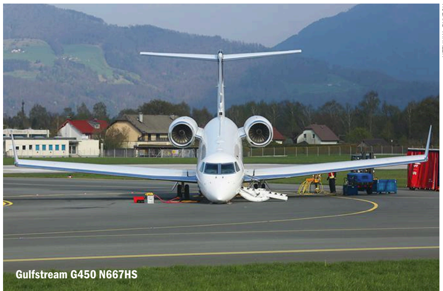
Gulfstream G450 N667HS

I once fell into a common trap of those who fly the same trip, over and over. I was used to arriving at Teterboro Airport, New Jersey (KTEB), and asking for the minimum amount of fuel to waive handling fees. For my aircraft at our favorite FBO, that meant 560 gal., more than enough to make it home to Hanscom Field, Bedford, Massachusetts (KBED). One day we broke the pattern with a second leg to Mexico City. As the fuel truck driver gave me the "I'm done, are we done?" thumbs up, I looked at the fuel gauges and realized 10,000 lb. of total