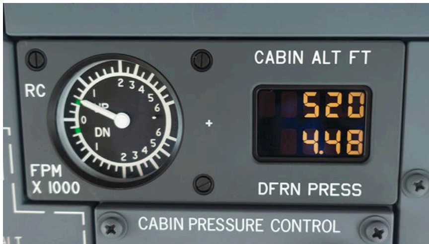
A Gulfstream G450 cabin altitude gauge in a climb, passing 10,000 ft. aircraft altitude.

it or, in fact, what to check. I can offer a technique to reliably prevent a pilot's failure to notice their aircraft has failed to pressurize before it's too late.