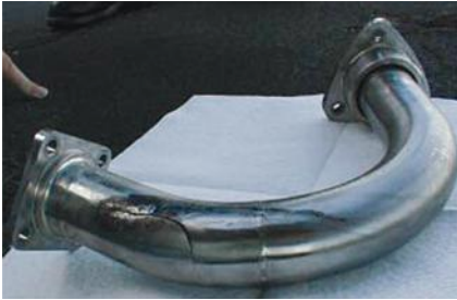
Air Transat 236's cracked fuel pipe

the same: You need to worry about having enough gas from the moment the fuel truck arrives until the engines are shut down at your destination.