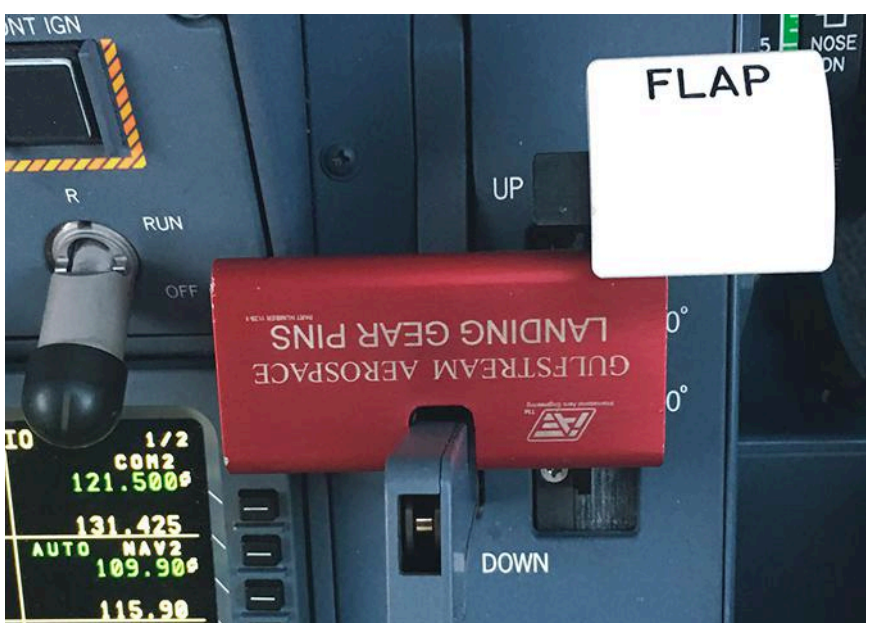
Gulfstream gear pin holder installed between the gustlock and flap handles.

activated. The nose landing gear retracted, causing the nose to fall on to the pavement. Since the main landing gear had a higher proportion of weight and a different mechanical downlock system, the mains remained extended. The aircraft was damaged significantly.