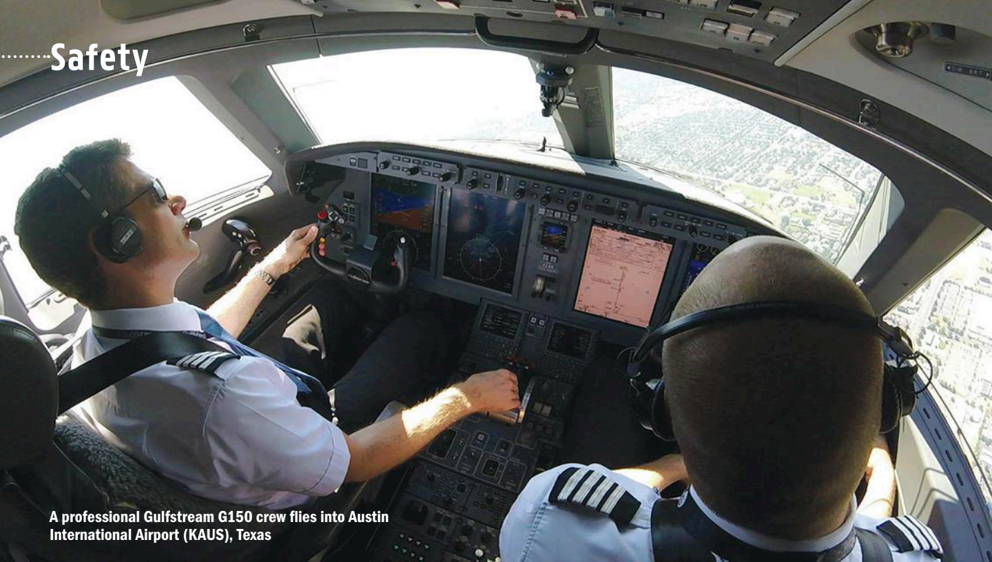
A professional Gulfstream G150 crew flies into Austin International Airport (KAUS), Texas