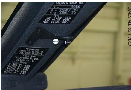
Pilot's eye alignment indicators, from a Gulfstream G450

As a newly minted captain, you hope to spend thousands of hours in the left seat so it's only natural you will want to find a position that is comfortable. But comfortable is not always optimal. Some prefer sitting lower and further aft than is prudent and others think up close and personal makes it easier to judge the landing flare. Both of these notions are the wrong approach to seat