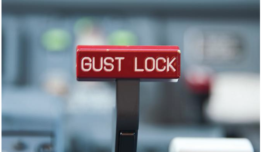
Gulfstream gust lock handle

click" while landing in a gusty wind condition. Those pilots advocated using only the forward switches to disengage the autothrottles. But since the manufacturer didn't mandate a procedure, some pilots continued to use the aft switches to disengage. It was a technique.