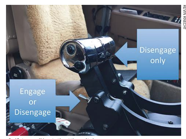
Gulfstream IV autothrottle switches

In its report, the NTSB was quick to blame the pilot's inadvertent engagement of the autothrottle system after touchdown. That finding led most pilots to write off the crash as just another aircraft systems problem. But it wasn't that at all.