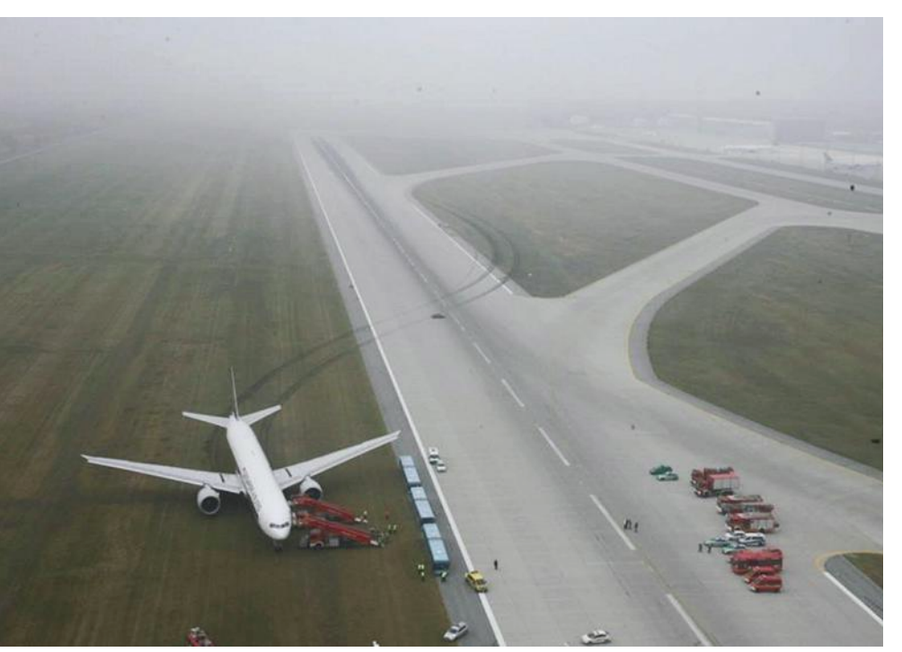
Singapore Airlines Flight 327, aircraft position after stop.

Civil Aviation Organization's criteria of 550 meters (1,805 ft.) visibility and 60 meters (200 ft.)ceiling. The ILS critical area was not protected during Flight 327's approach.