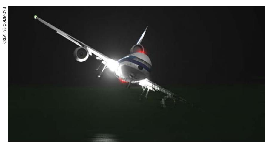
The pilots of Eastern Air Lines Flight 401 prioritized systems repair over flying the airplane before crashing into the Everglades

down. The captain consulted with his flight crew and all available company resources on the ground. He concluded that the gear was probably extended, but he wanted to make sure the cabin crew had enough time to prepare the passengers for a possible gear collapse upon landing.