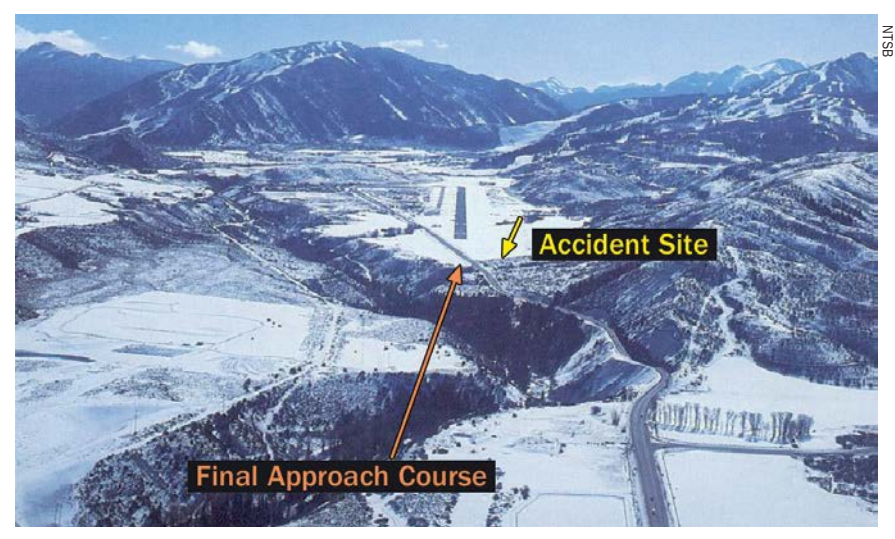
Gulfstream III N303GA approach path

Unfortunately, the charter customer and his passengers arrived late to the airplane in Los Angeles, which delayed the Gulfstream's arrival at Aspen a few minutes later than allowed by the nighttime restriction. The charter customer stressed the importance of landing at