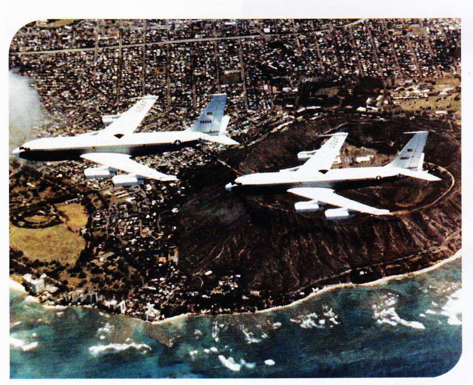
"It was a nice airplane for the time, but the systems were pretty rough by today's standards."