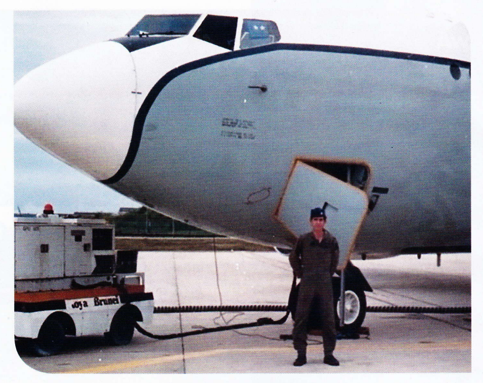
"And I would be what they all called the old man. I was twenty-seven."