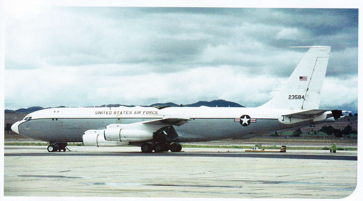
"The Boeing 720, what the Air Force called the C-135B and other variants, was Boeing's failed attempt to come up with a long-range version of the Boeing 707"

found myself with my first soul-searching moment as the guy in charge.