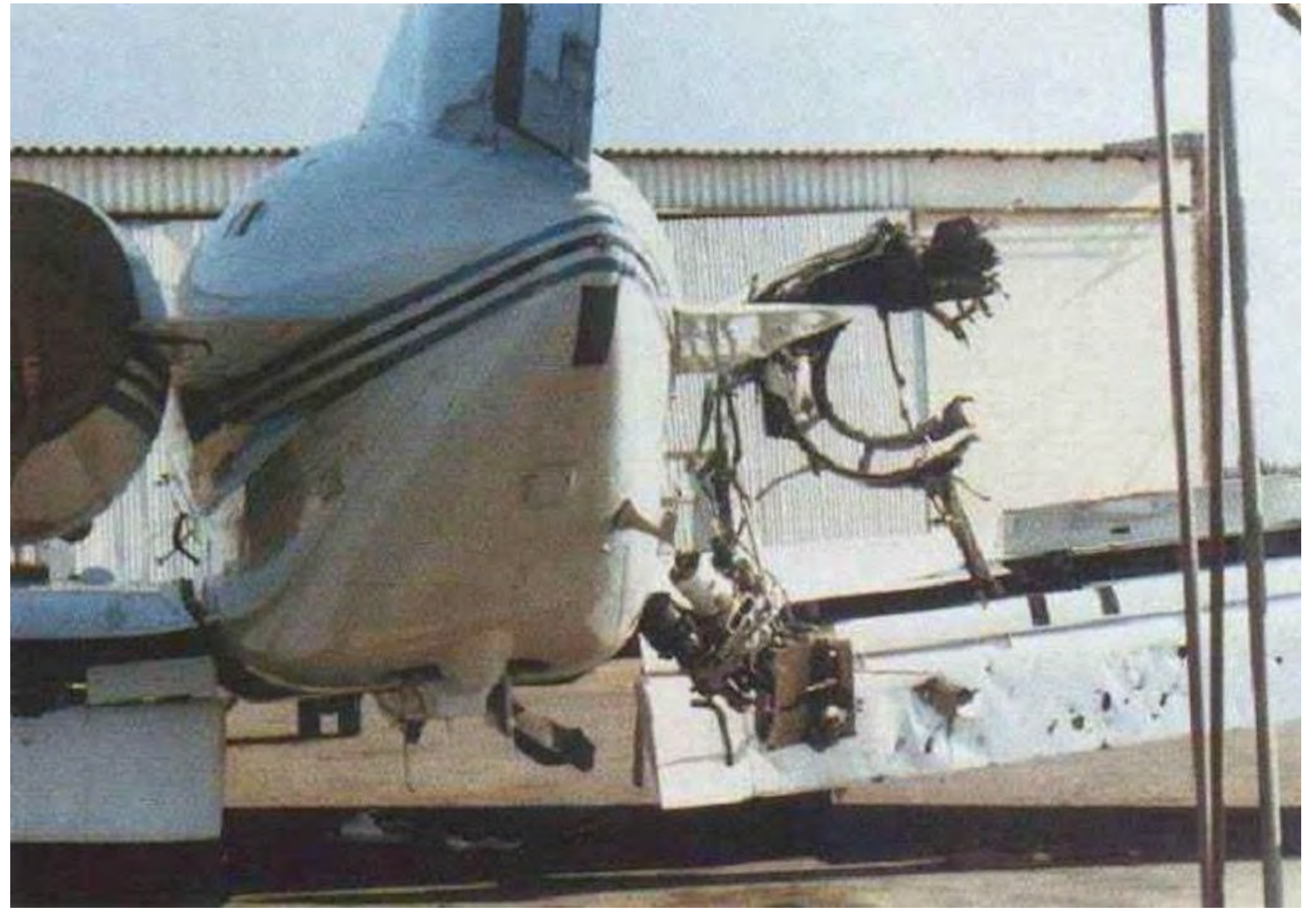
VIP BAe 125-800 after missile strike to right engine in 1988.

There are commercial systems available for business jet aircraft that are purely electronic (jamming), mechanical (chaff), or a combination of the two.