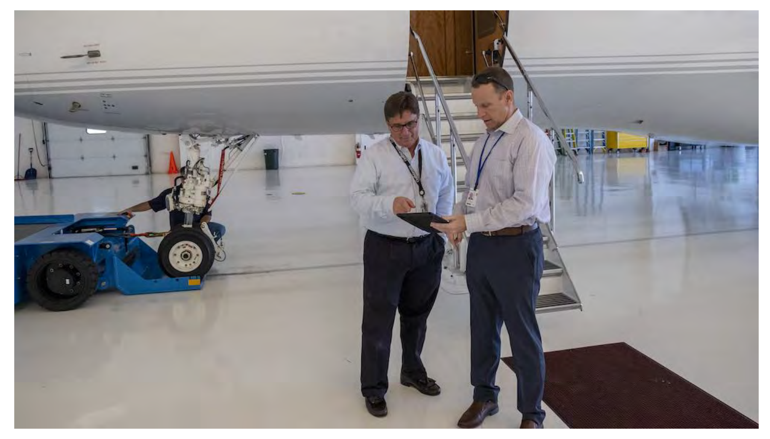
All crewmembers should have respect for each other.

A final trait of a person capable of being better is respect. You cannot motivate yourself to be a better professional if you don't respect the profession, your peers and yourself. It is a sine qua non, without this, nothing.