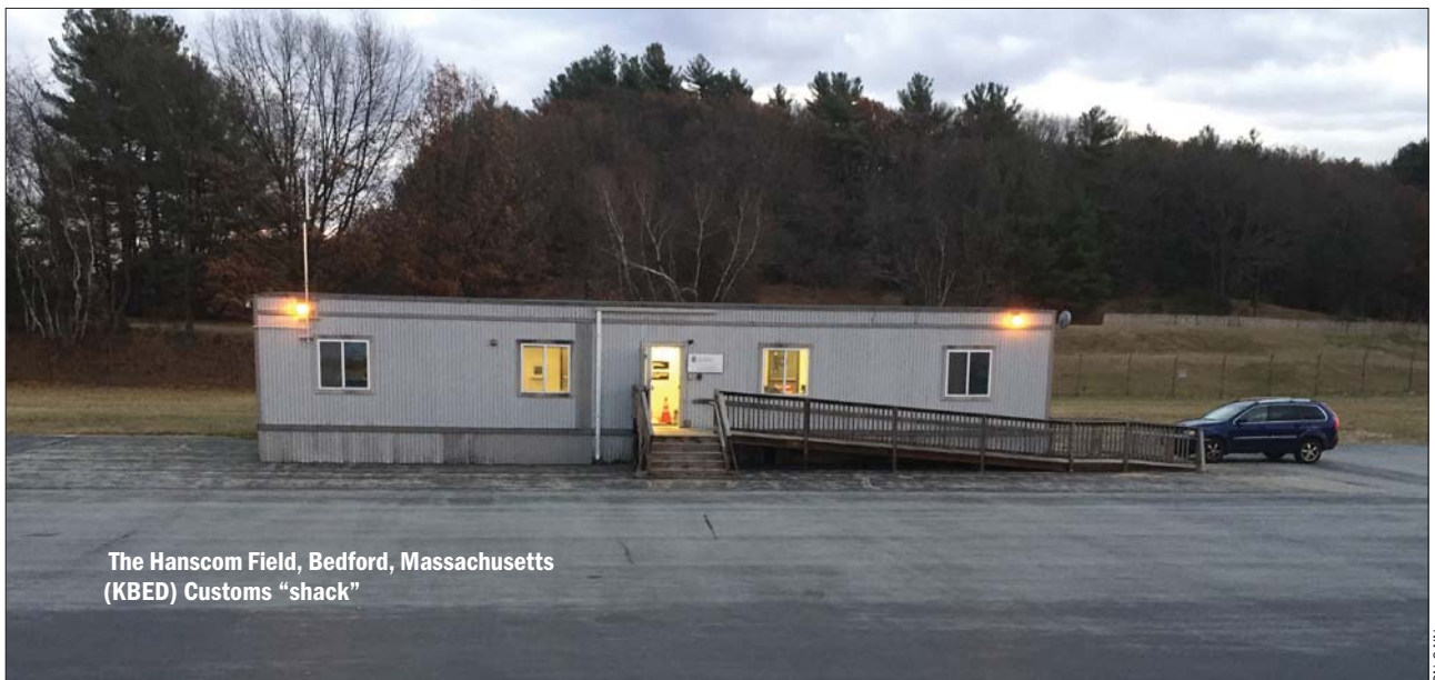
The Hanscom Field, Bedford, Massachusetts (KBED) Customs “shack”

As noted, all ICAO signatories are allowed to deviate from the standard provided they publish those differences in their AIP. The U.S. has many such differences, published in Section GEN 1.7 of the AIP. I recommend you first understand how your home country’s rules