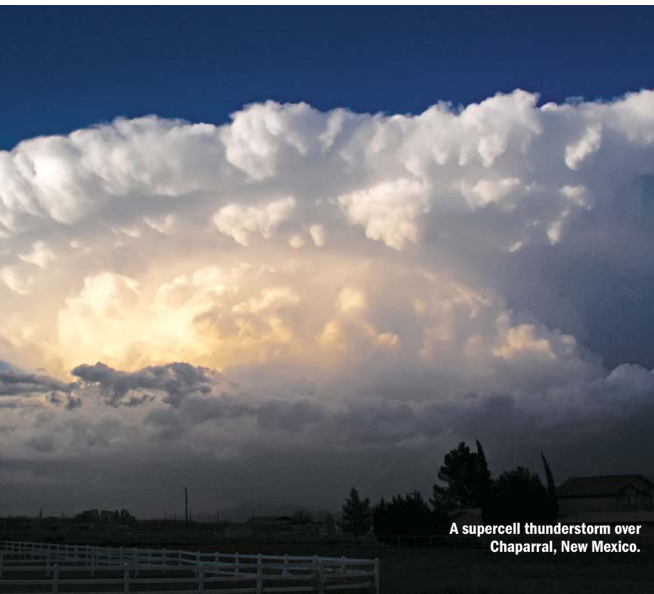
A supercell thunderstorm over Chaparral, New Mexico.

The U.S. flying environment is a friendly one. Let me join with my fellow U.S. aviators and say, "Welcome to the United States." BCA