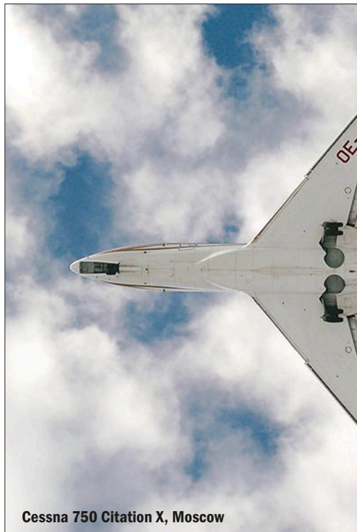
Cessna 750 Citation X, Moscow