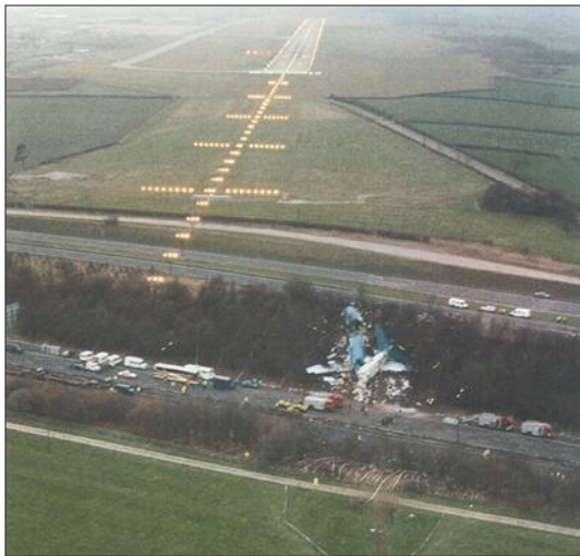
BRITISH ACCIDENT REPORT PHOTO