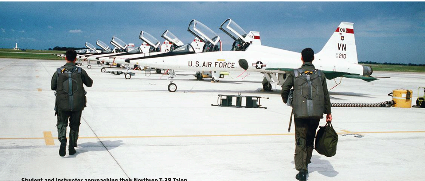
Student and instructor approaching their Northrop T-38 Talon

In the early days of passenger-carrying jets, most manufacturers seemed to have agreed with the military: Flying a high-speed jet is risky business and pilots needed to have ice water in their veins. Back then, memory items were